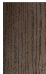
Frassino color liquirizia