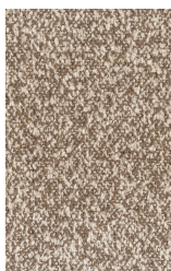
LIPARI - 3 - PLATINUM