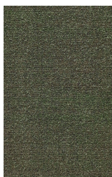
SANREMO - 03 - EXTRA