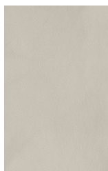
ANILINA - 4307 - B - PLUS