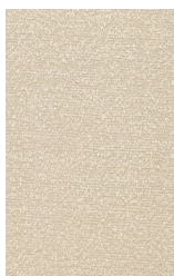
SANREMO - 26 - EXTRA

With the Dao Soft sofa, designer Gordon Guillaumier proposes a modular system that focuses on planning freedom and the geometric harmony of soft, calibrated volumes. Designed to create environments devoted to well-being and calm, the Dao Soft sofa stands out for its ability to adapt to formal or informal settings, thanks to balanced proportions and a discreet but recognizable aesthetic. High backrests and seats with differentiated polyurethane padding and Cloud Foam and Microflock inserts ensure great comfort, meeting the needs of the project in both residential and contract settings. Available in two variants - Dao Soft Base, with an upholstered base, and Dao Soft Light, with black feet - the collection is completed with a strong sartorial connotation, expressed in the sewing "a pizzicotto" that features the cover either in fabric or leather with a precise, textural hallmark. In the proposed versions, the Dao Soft sofa is explored through different spatial solutions, to offer concrete tools in defining welcoming, flexible environments consistent with a measured and contemporary design language.